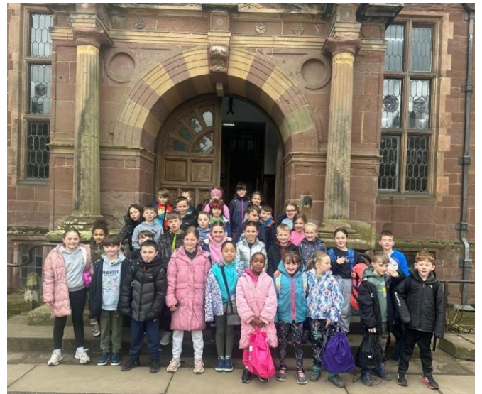
Newhampton Federation children at Condoover

It was clear to see that they were having a brilliant time... but no doubt they will be ready for a good night's sleep this evening!